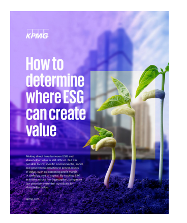
How to determine where ESG can create value