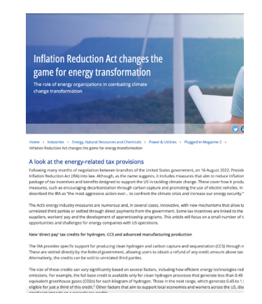
Inflation Reduction Act changes the game for energy transformation - KPMG Global

Some or all of the services described herein may not be permissible for KPMG audit clients and their affiliates or related entities.