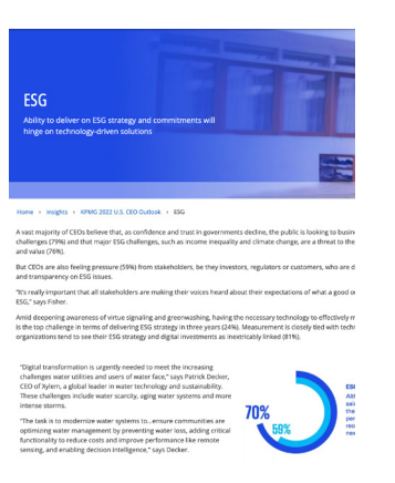
KPMG 2022 U.S. CEO Outlook | ESG - KPMG United States